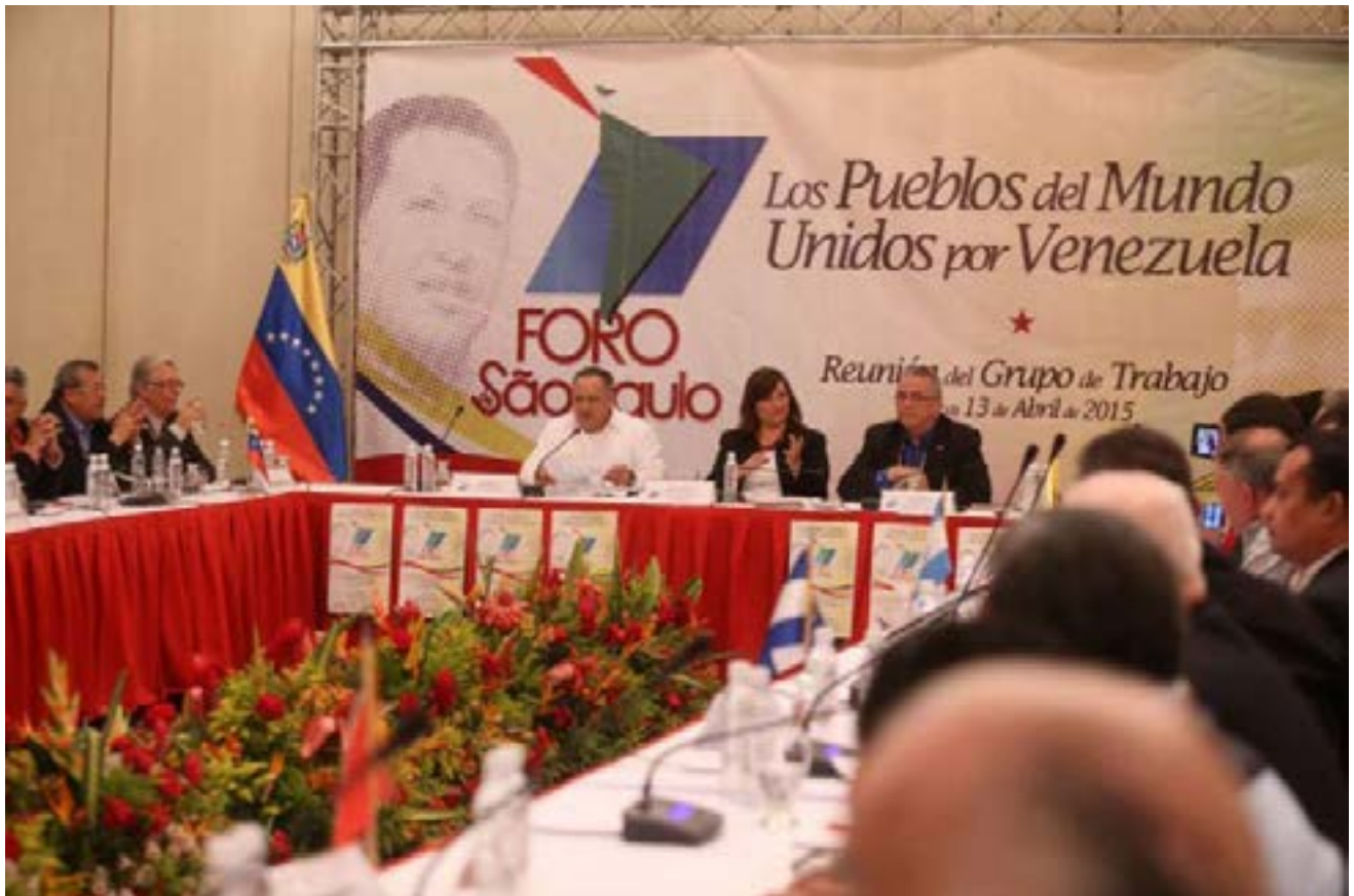
Members of the Forum of São Paulo ( Foro de São Paulo) from Latin America and the Caribbean meet 13 April 2015 in Caracas, Venezuela, to ratify their support for Venezuela's disputed President Nicolás Maduro. The meeting was held in the face of a U.S. decree issued by President Barak Obama declaring the South American country a threat to U.S. national security.

Key Trans- or International Facilitating Organizations. Finally, several regional international organizations are prominent within the collective. These include the Union of South American Nations ( Unión de Naciones Suramericanas or UNASUR), the Community of Latin American and Caribbean States ( Comunidad de Estados Latinoamericanos y Caribeños or CELAC) and the Bolivarian Alliance for the Peoples of Our America ( Alianza Bolivariana para los Pueblos de Nuestra América or ALBA). 8