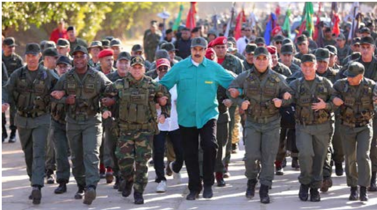
Venezuela's disputed President Nicolás Maduro marches with members of the Venezuela's armed forces 27 January 2019 during military exercises at Fort Paramacay in Naguanagua, Carabobo State, Venezuela.

lettering FARC-EP, with the EP standing for Army of the People ( Ejército del Pueblo ). 36