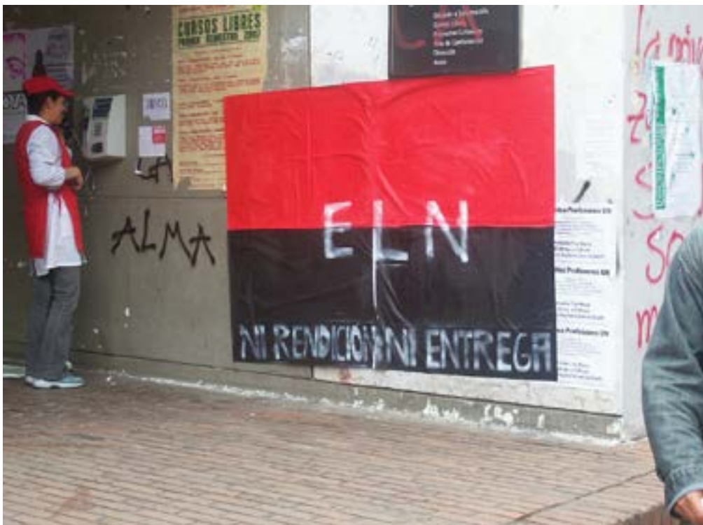
A National Liberation Army ( Ejército de Liberación Nacional) guerrilla poster 7 March 2007 at the León de Greiff Auditorio, National University of Colombia in Bogotá. The poster reads "Ni Rendición, Ni Entrega," which translates to "Neither Surrender, Nor Yield."

by the United States. It is older than both UNASUR and CELAC, having been founded circa 2003. ALBA is styled as a governments-based international organization, and while smaller in terms of participating countries (currently nine) than UNASUR or CELAC, it presents itself as the most decidedly resolute in support of the PCC and PSUV. 35 Ecuador and Honduras