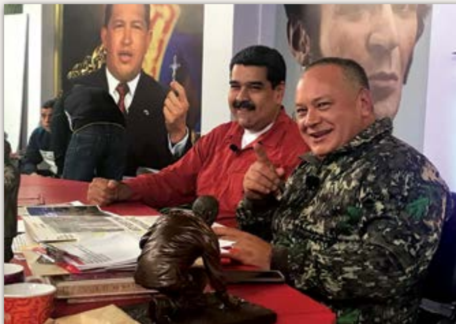
Venezuela's disputed President Nicolás Maduro (left) joins the president of the Venezuelan National Constituent Assembly, Diosdado Cabello, to celebrate the two hundredth chapter of the "Con el Mazo Dando" program 12 April 2018 on set in Caracas, Venezuela. Cabello is host of the program that is broadcast on the Venezuelan state channel, Venezolana de Televisión.

In an effort to help the reader gain a better understanding of the intertwined forces negatively affecting Venezuela and the entire region, this article identifies a malign network of diverse organizations that exists in Latin America and provides a series of observations that illuminate how the organizations in that network relate to each other. It is intended to unravel some unnecessary complications in the analysis of dangers and prospects in northern South America and the Caribbean. Hopefully, it will inform reader