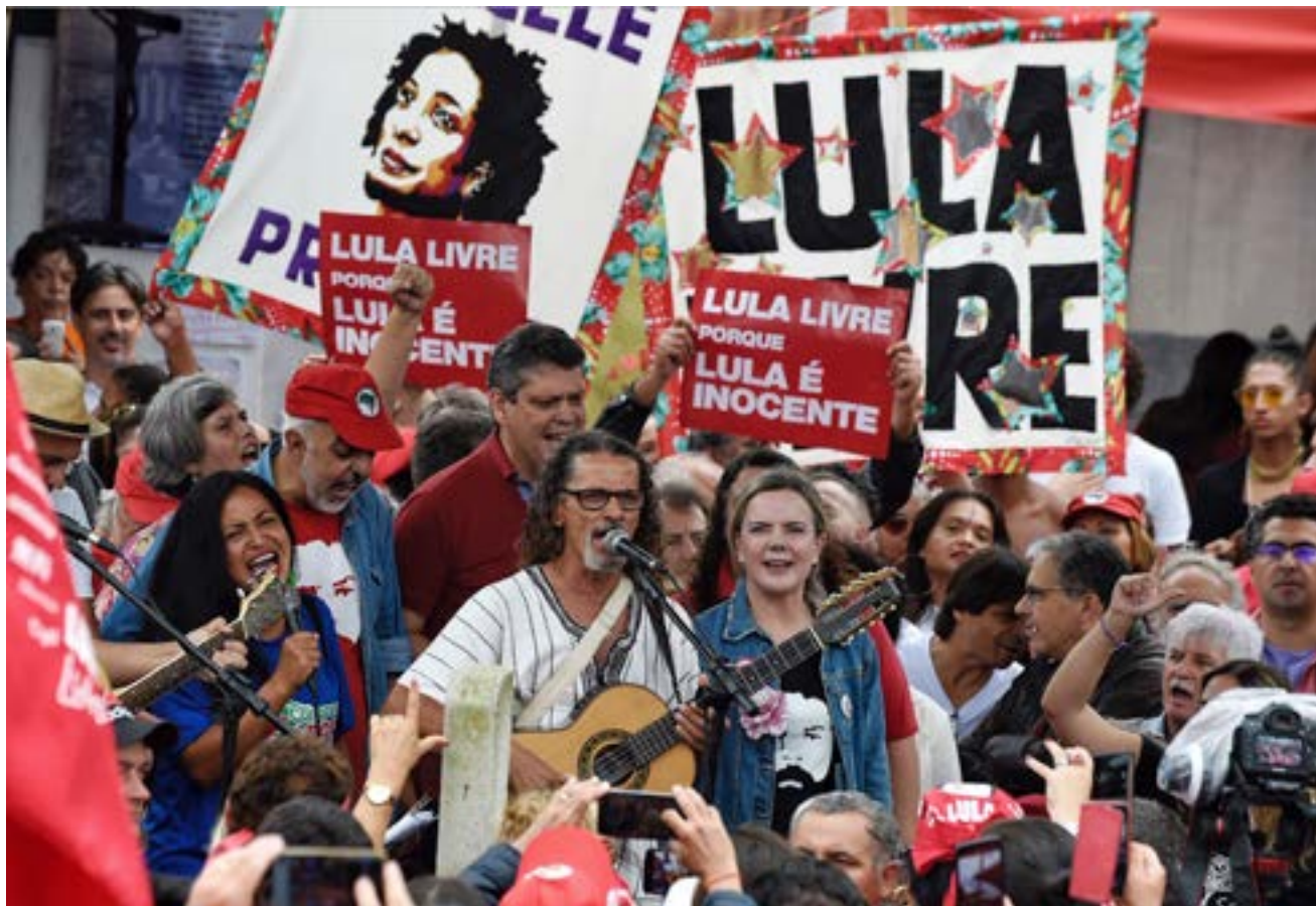
Workers' Party President Gleisi Hoffmann ( center right) attends a demonstration 7 April 2019—the anniversary of the incarceration of former Brazilian President Luiz Inácio Lula da Silva—outside the jail where Lula is being held in Curitiba, Brazil. While Lula serves a twelve-year sentence for corruption and money laundering, he and his party maintain his innocence and claim persecution by political enemies to prevent him from running again for president.

United Socialist Party of Venezuela ( Partido Socialista Unido de Venezuela or PSUV) are at the apex of the regional anti-American network collective. 2 Also, although not currently in control of the reins of its country's central government, the Brazilian Workers' Party ( Partido dos Trabalhadores or PT) is a third leading organization within the whole network. 3